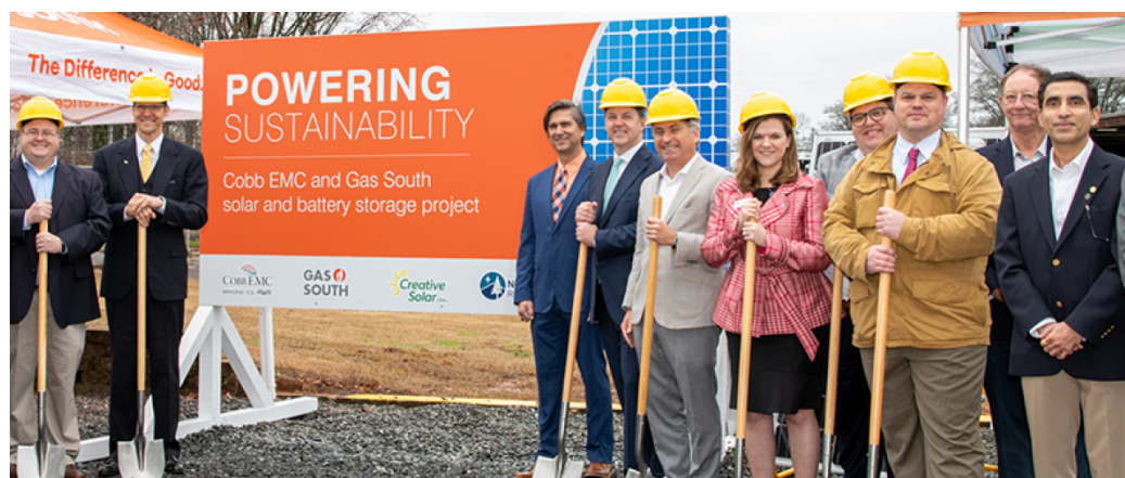
Above: Cobb EMC, in Marietta, Georgia, partnered with a taxable subsidiary, Gas South, to monetize tax credits in acquiring a solar-plus-storage microgrid project.

In order to purchase a battery, the local co-op, which is non-taxable, may have to forego the investment tax credit. Although the cost may be higher, a battery that is not financed with the expectation of the investment tax credit could be charged from the grid to a much greater degree, relative to ITC-eligible solar-plus-battery projects. For example, United Power, a large co-op near Denver, Colorado, purchased a 4 MW battery in 2018. Although ownership brings some flexibility, the battery is still subject to operating requirements under warranty. A variation on this model is gaining prominence. Sometimes the ownership model is driven by strictly physical factors, as with utilities that are located in geographically isolated areas, where distributed generation is the norm. It also may be driven by the need to balance high levels of renewable generation to meet policy goals, or by opportunities to defer distribution system upgrades while addressing power-quality and resilience needs.