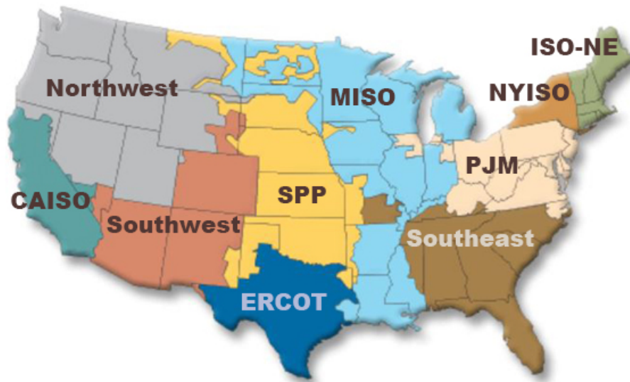
Figure 2. U.S. electric utility Independent System Operators (ISOs) and Regional Transmission Organizations (RTOs) in 2021.